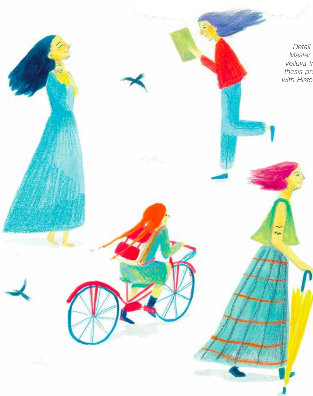
Detail of illustration by Master graduate Letizia Veiluva from "La felicità", thesis project for release with Historias para todos.